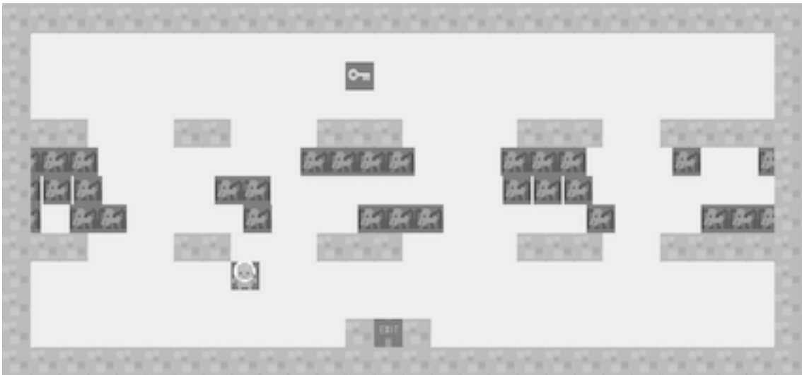
Figure 6: A screenshot of Frolda running in the GVG-AI Java emulator. The player (bottom left) has to cross the ‘road’ of monsters to get the key (top) and then cross again before exiting the level (bottom).

VGDL, we propose to express the level idiom in the form of a declarative level generator, e.g. in ASP (Smith and Mateas 2011), and blend these generators in concert with the rest of game description. Other aspects of visual design (e.g. sprites) could be developed through blending, building on recent work in icon blending (Confalonieri et al. 2015). Given its focus on game-playing agents, VGDL does not currently support any audio that could be blended, although it would be relatively easy to extend with simple audio effects to support research in that direction.